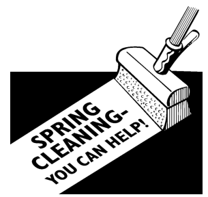
Spring Cleaning at Faith in Cataract