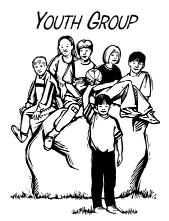
The youth group will meet for another night of Bible Class and games on Friday, May 20<sup>th</sup>, at 6:30 p.m.